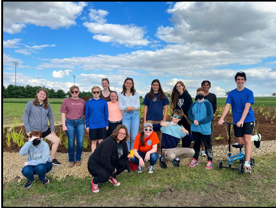
Environmental Studies Class at Clearview Farm