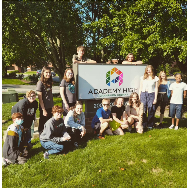
Class of 2024 Ready to Start Their Senior Year