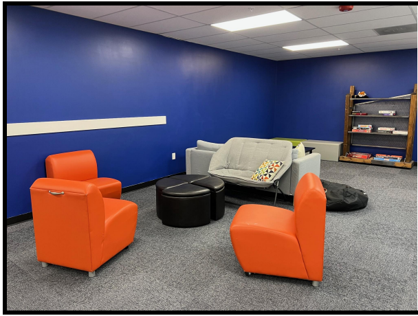
New student lounge area