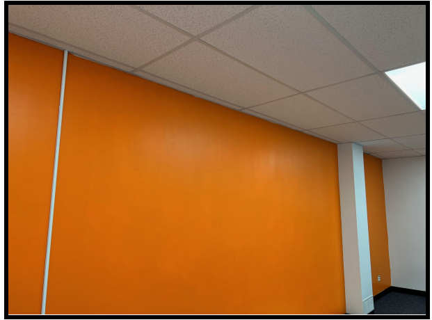
R5 is one of the rooms brightened up with color!