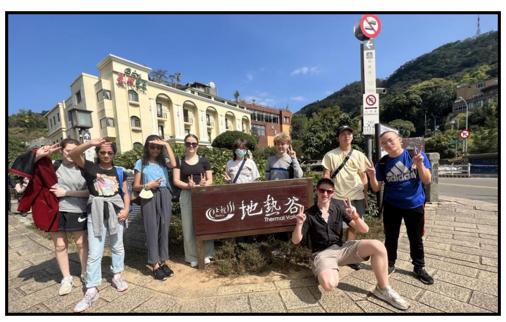
Over Spring Break, students in our Chinese classes traveled to Taiwan!