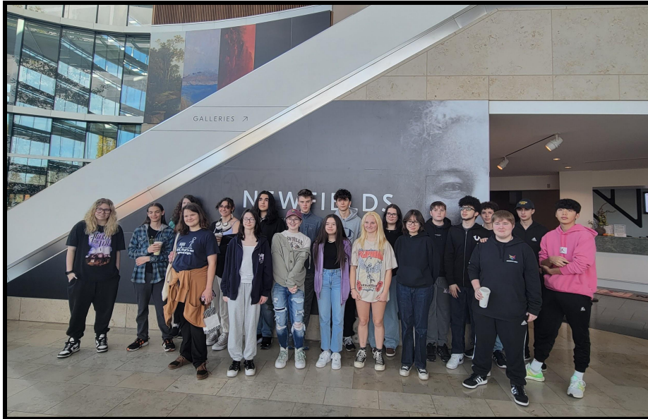
9th, 10th, and 11th Graders Enjoyed the Lume Experience at Newsfields Museum